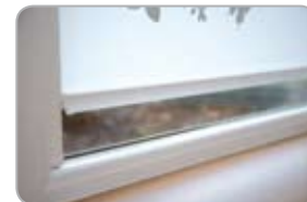
INTU® streamlined bottom bar