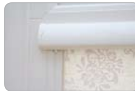
Unique INTU® roller fascia

The unique design of the INTU® Roller low profile fascia gives a sleek, modern appearance, taking the popular roller blind to a new level.