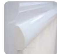
INTU® discreet fascia

The streamlined bottomrail gives perfect control. Easily locking into position at any point, INTU® Roller also provides outstanding energy efficiency and room darkening options with blackout, solar reflective and fire retardant fabrics. The INTU® Roller is particularly 'child safe' eliminating all hanging cord loops or chains.