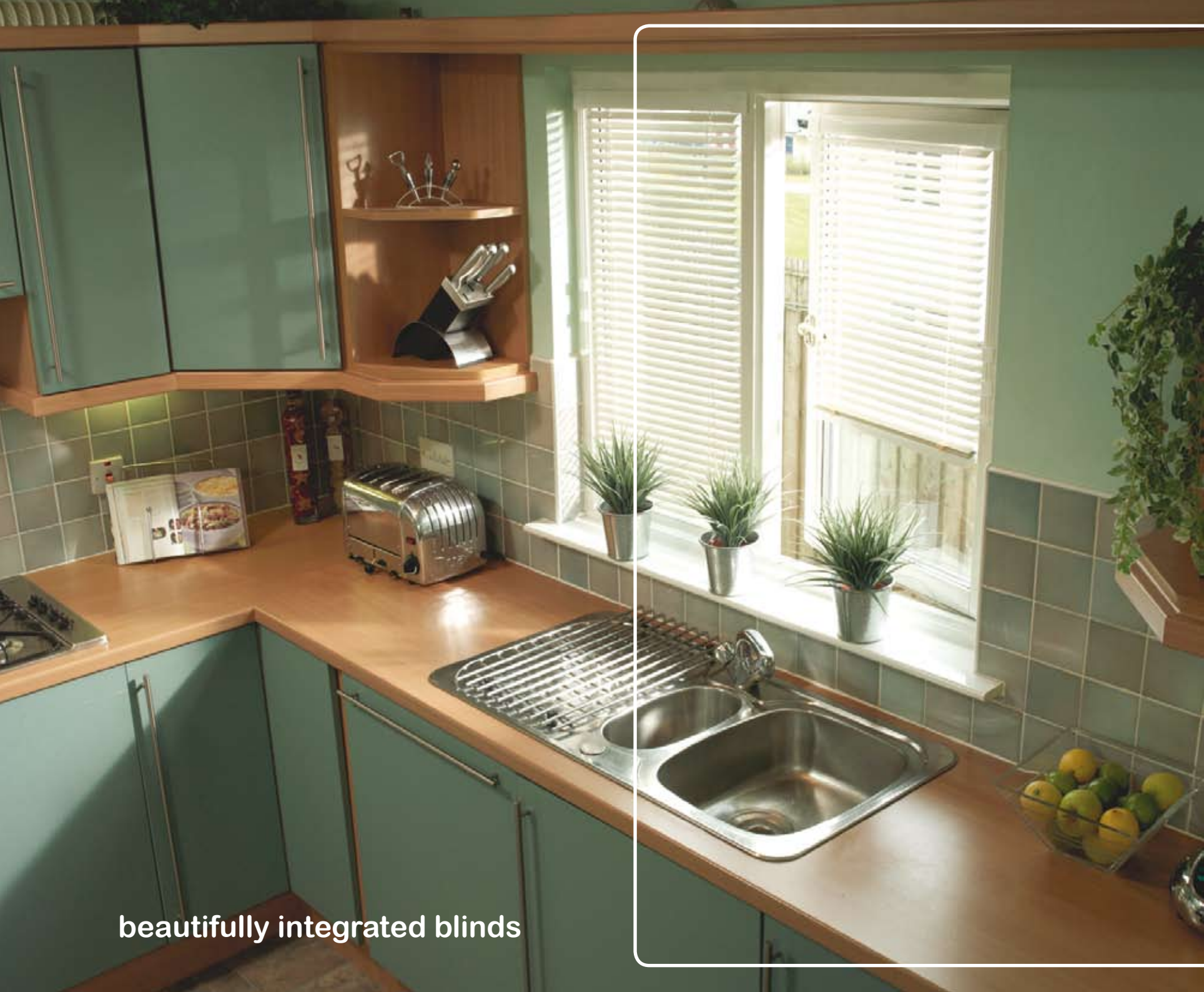
beautifully integrated blinds